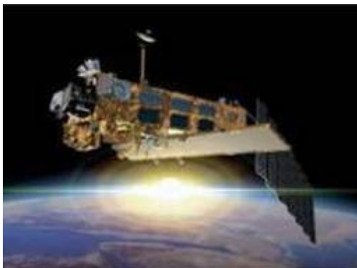
Typical SAR Satellite

The value of offshore seep data is much enhanced if they can be validated, either by linking to sea bed seepage indicators, e.g. to carbonate mounds on multi-beam sonar or from seepage related features shown on 2D or 3D seismic data; this may then provide the migration pathway from trap to surface—examples from Angola and Gabon will be shown. Sampling seeps at the sea surface can also prove a perfect low cost way of obtaining key geochemistry data well ahead of the drill.